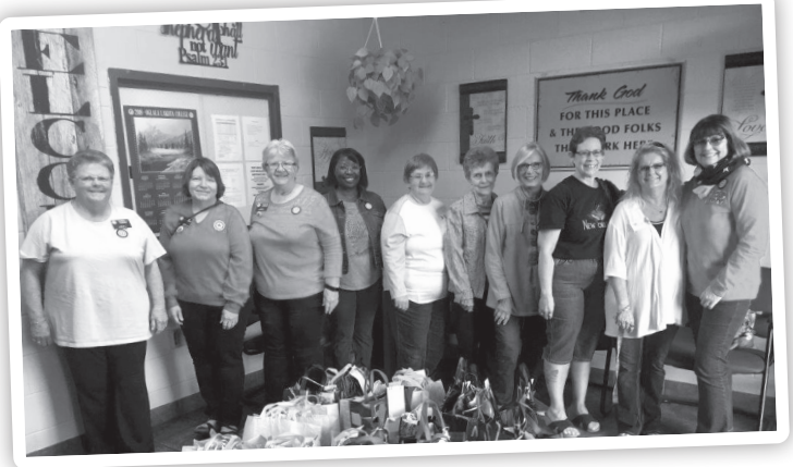
The Spearfish American Legion Women's Auxiliary came for a tour and brought a gift bag for each of the Veterans. So thoughtful!