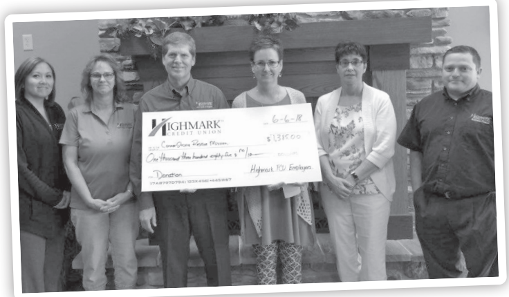
Highmark Credit Union donated their Friday Jeans Day collection to us. Thanks!